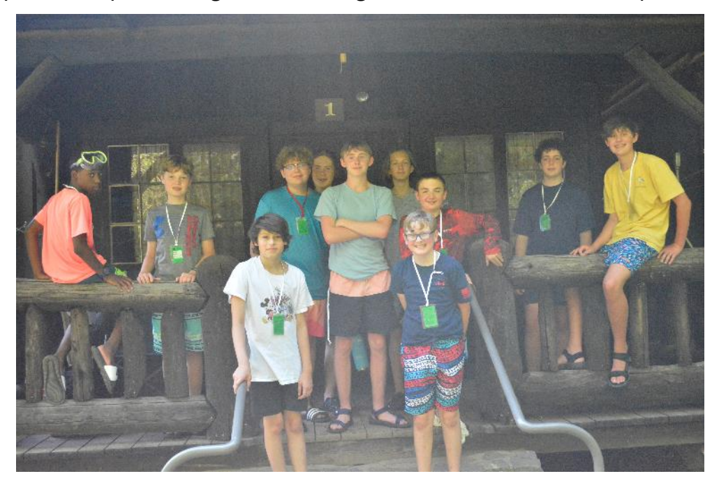
Figure 8 You will make new friends with your cabin mates while you spend the week without the distractions of modern life

KP is where campers are asked to set the tables, act as servers, clear the tables, dry silverware and bowls and mop and sweep the dining room. A Dining Hall staff member leads campers in KP.