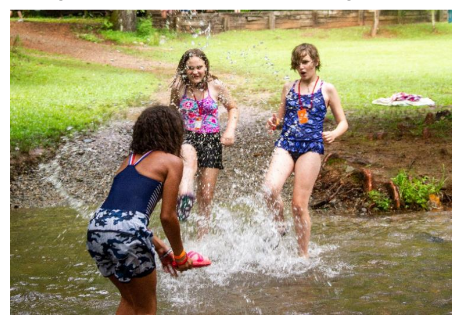
Figure 3 Playing in the creek is always very popular during hot summer days