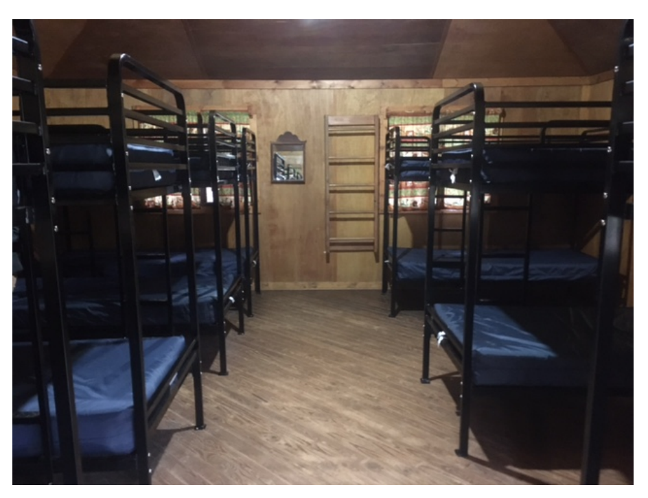
Figure 7 Bunk beds are Twin XL. Bring your own sleeping bag and pillow.