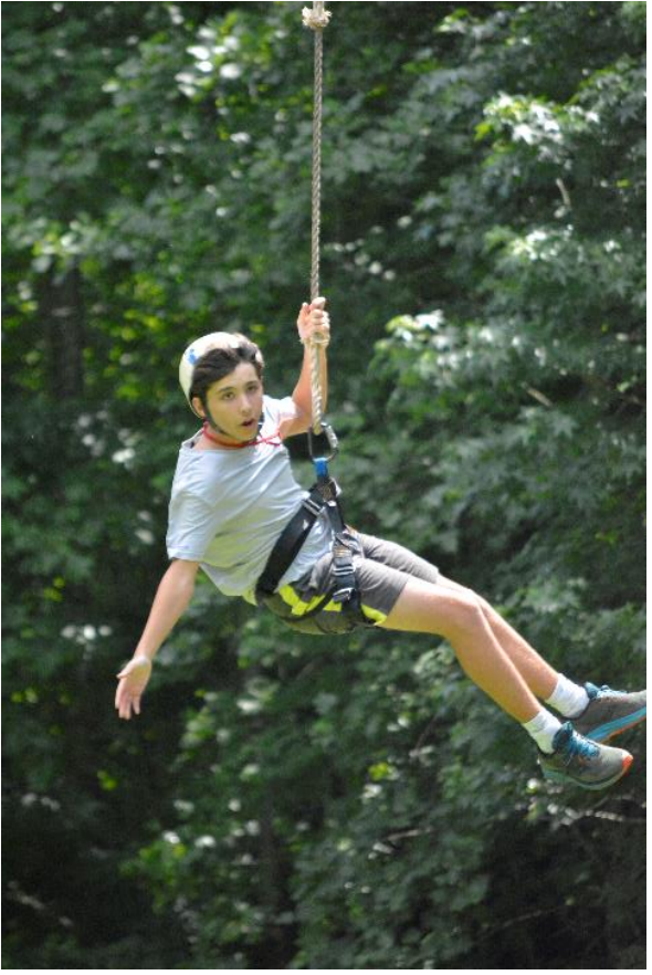
Figure 10 All youth will have the chance to try out our high ropes activities including climbing wall, zip line, and the flying squirrel

If parents need to call Wahsega, Expect to: