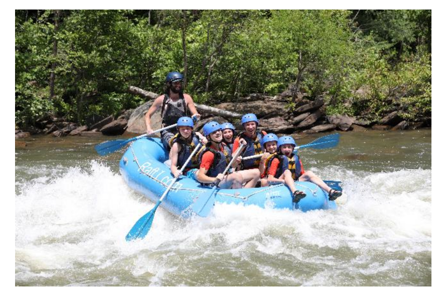
Figure 1 Whitewater rafting on Thursday is a major highlight of the week. All rafts have a professional guide, not experience is necessary.