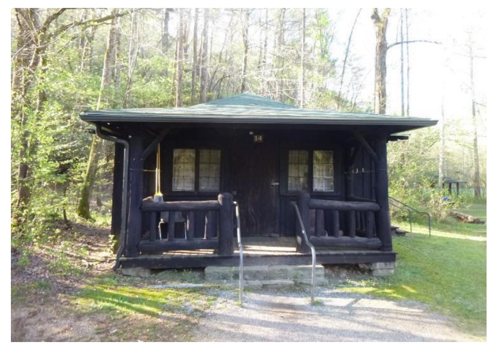
Figure 6 Traditional cabin at Wahsega 4-H Center. 1 or 2 adult chaperones will stay with campers in each cabin. Bathrooms are located a short walk away at the bathhouse.