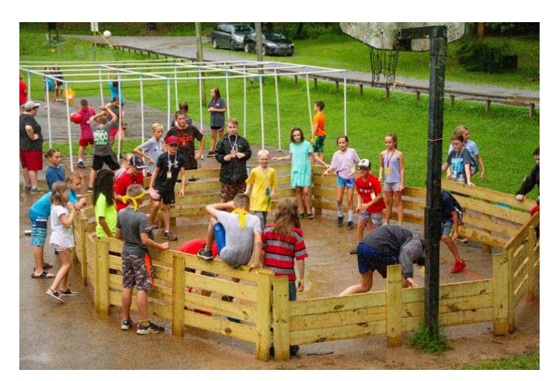
Figure 2There are many free time recreation games to play including Ga Ga Ball.