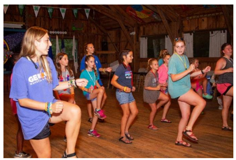
Figure 5 Evening Rec Time always includes line dancing led by super fun 4-H Camp Counselors