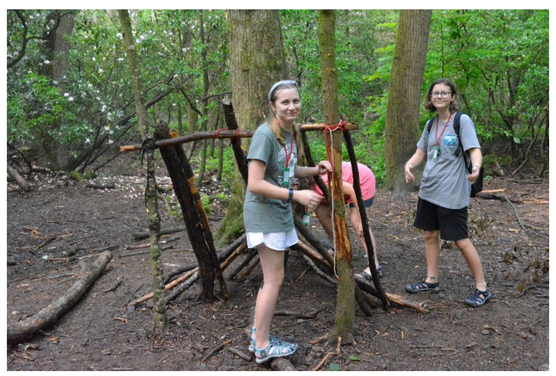
Figure 9 Youth will learn new outdoor skills with our many classes including "Shelters and Knots"

There are no additional or optional activities that cost extra money. For example, there are no optional arts & crafts or optional water activities that cost extra money. Only snacks and souvenirs cost extra.