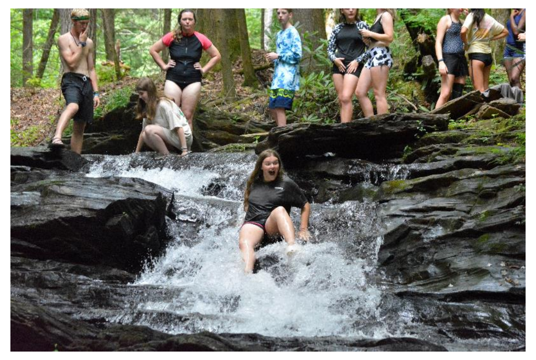
Figure 4 Counselors will guide and supervise kids to safely slide down our very own waterfall