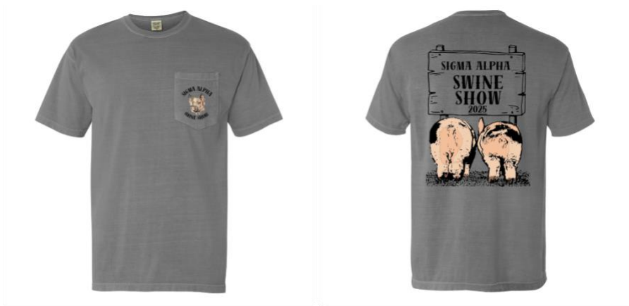
Print Type: Screen Printing Dimensions: 3.27" w x 3.50" h - Max Pocket Size