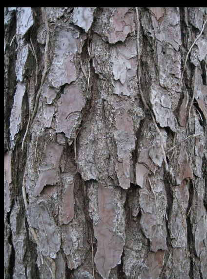
Loblolly Pinus taeda