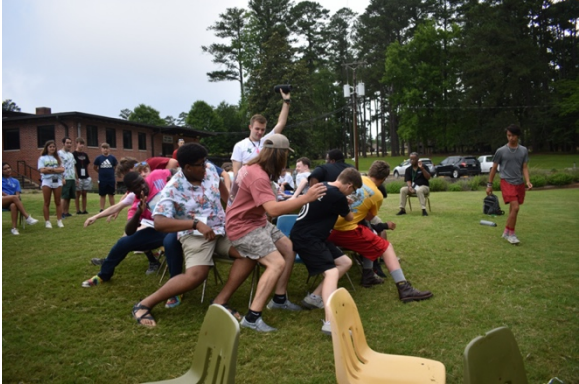
Chalanda Woods Coffee County