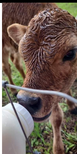
Tapanga Osteen Candler County