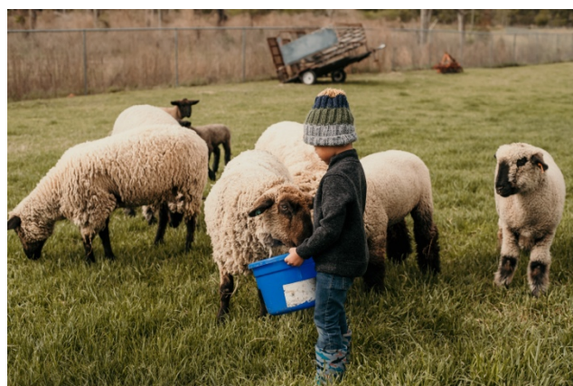
Chalanda Woods Coffee County