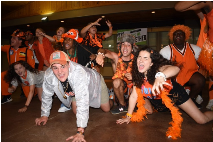
Chalanda Woods Coffee County