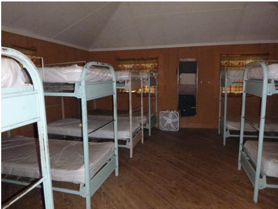
Inside of a cabin: Adult leaders sleep in the same room to provide excellent supervision and keep kids safe.

Be sure to pack your own sleeping linens.