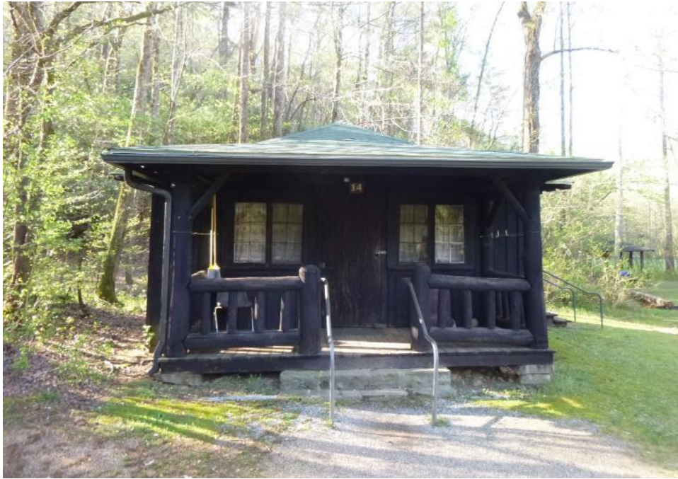
Cabins built in the 1930's provide a true camp experience