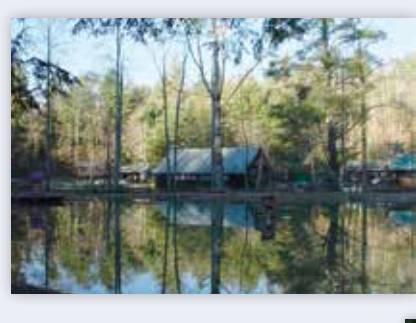
1937 – A request to use an abandoned CCC work camp for 4-H camping leads to the opening of Camp Wahsega in the north Georgia mountains near Dahlonega.

1946 – The City of Savannah Beach (now Tybee Island) donated six acres of land and the Chatham County 4-H Club camp opened the next year. This later becomes Tybee Island 4-H Center,