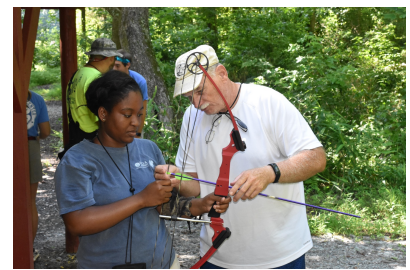
PHOTO RELEASE STATEMENT

By submitting photographs to the Georgia 4-H Photo Contest (either on your own or through your local County Extension Office), you certify that you are the individual who took the photograph(s) submitted, that you own the copyrights to the photographs and that you have the authority to enter into this release. You release Georgia 4-H from any liability that arises from the use of the photographs except for uses that violate the terms and conditions of this release. You agree to work in good faith with Georgia 4-H to promptly resolve any problems or disputes that may arise due to your submission of the photographs. By entering your photographs in the Georgia 4-H Photo Contest, you grant Georgia 4-H the royalty-free and non-exclusive right to use your photographs as follows: (i) on the Georgia 4-H/Georgia 4-H Foundation websites; (ii) for Georgia 4-H/Georgia 4-H Foundation posters, brochures, activity guides, and/or any other printed or electronic publications; (iii) in Georgia 4-H/Georgia 4-H Foundation electronic emails; (iv) and in any other internal or external marketing materials or media coordinated by Georgia 4-H/Georgia 4-H Foundation. You further waive the right to inspect or approve the final use of your photographs by Georgia 4-H/Georgia 4-H Foundation.