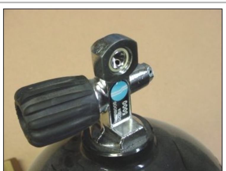
K-valve installed on tank

All systems that use a K-valve and a yoke are 3000-psi systems. The European airgun manufacturers such as Anschutz, FWB, Walther, Steyr etc, all use the European DIN valve system for their high-pressure SCUBA connections. Instead of using a clamp system, the DIN system uses male /female threads to attach to each other. Each manufacturer includes with its gun a small brass piece, called a fill adapter, that interfaces between the airguns cylinder and the SCUBA tank. These brass adapters will have a male thread on the SCUBA side designed for DIN connection, either 200 or