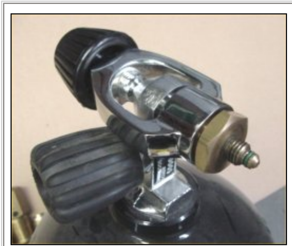
Yoke-installed k valve

Conversely, If you try to install a DIN valve on your tank, you will encounter a problem if you ever try to get it filled at any location other than your local shop, say you have traveled to match out of town. From a price and availability standpoint, it is difficult to get 200 DIN fittings in the US. As stated before, if one does encounter a DIN valve in the US, it normally will be a 300 DIN valve, which is for 4300 psi tanks. (Yokes are not considered strong enough for this additional pressure). Because of the higher pressures involved, these are more expensive.