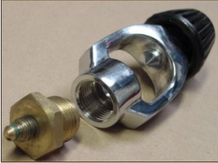
Yoke with filling adaptor

300 DIN. It is from this that a multitude of problems arise for the unsuspecting coach who walks into a dive shop and tries to purchase the correct fill mechanism.