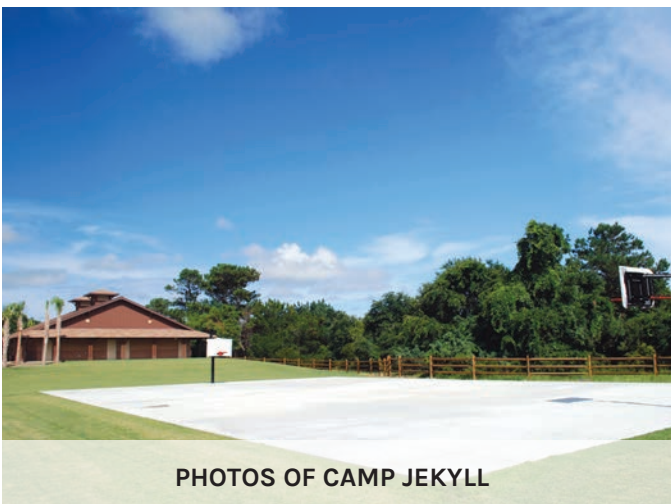
PHOTOS OF CAMP JEKYLL