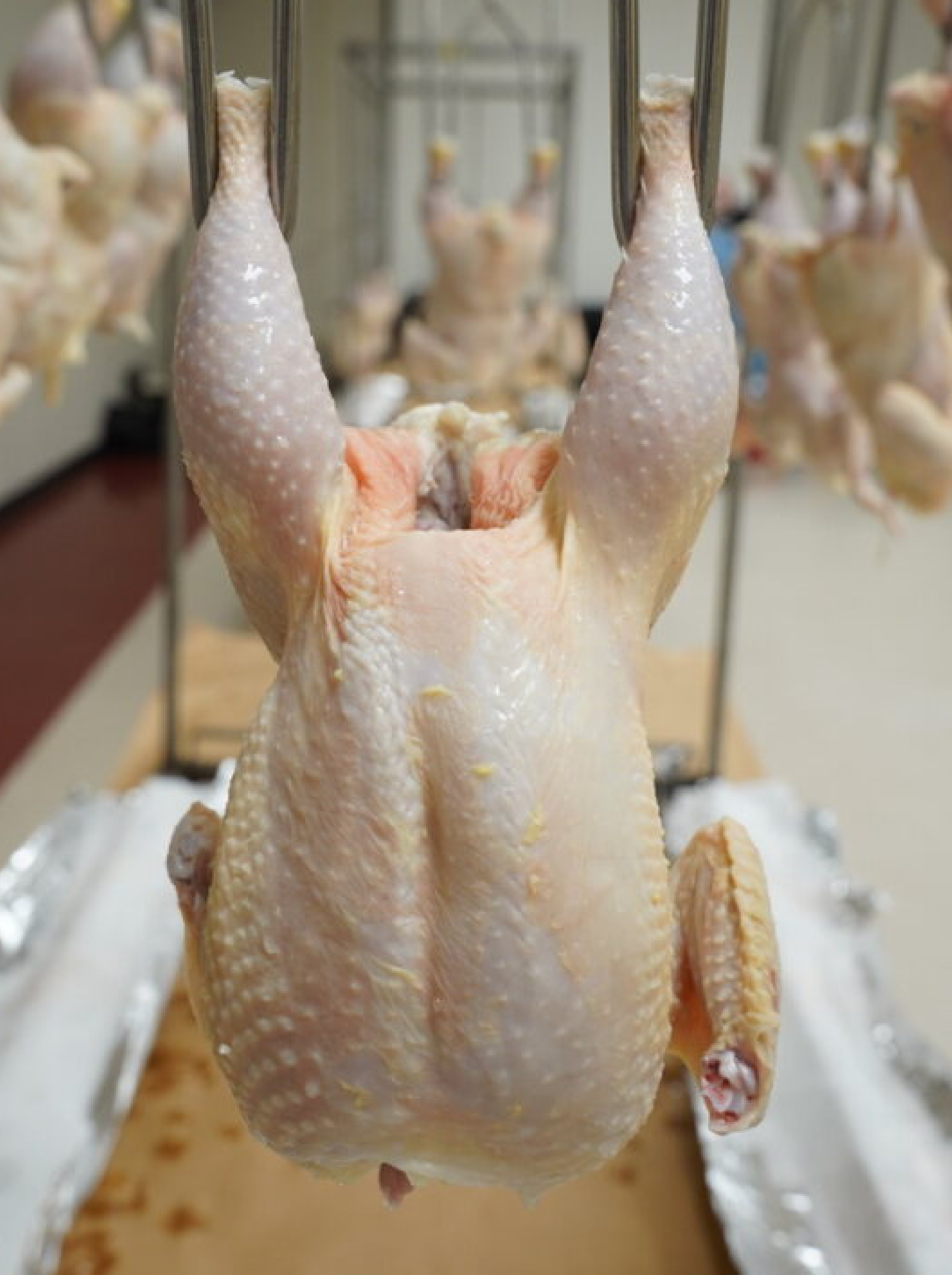
B Missing wing flat, exposed flesh on left thigh