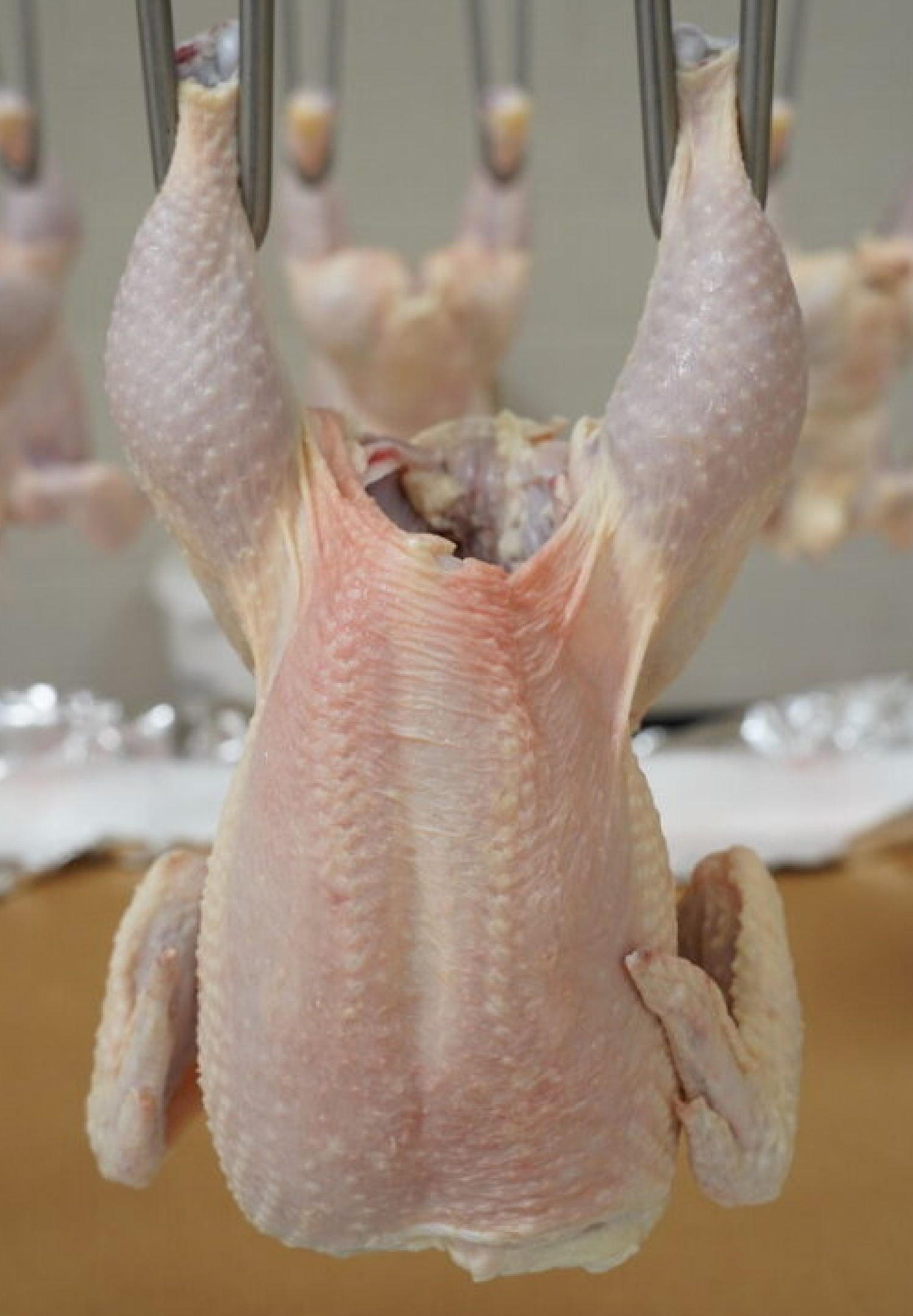
B Exposed flesh greater than 1/4" on the thigh