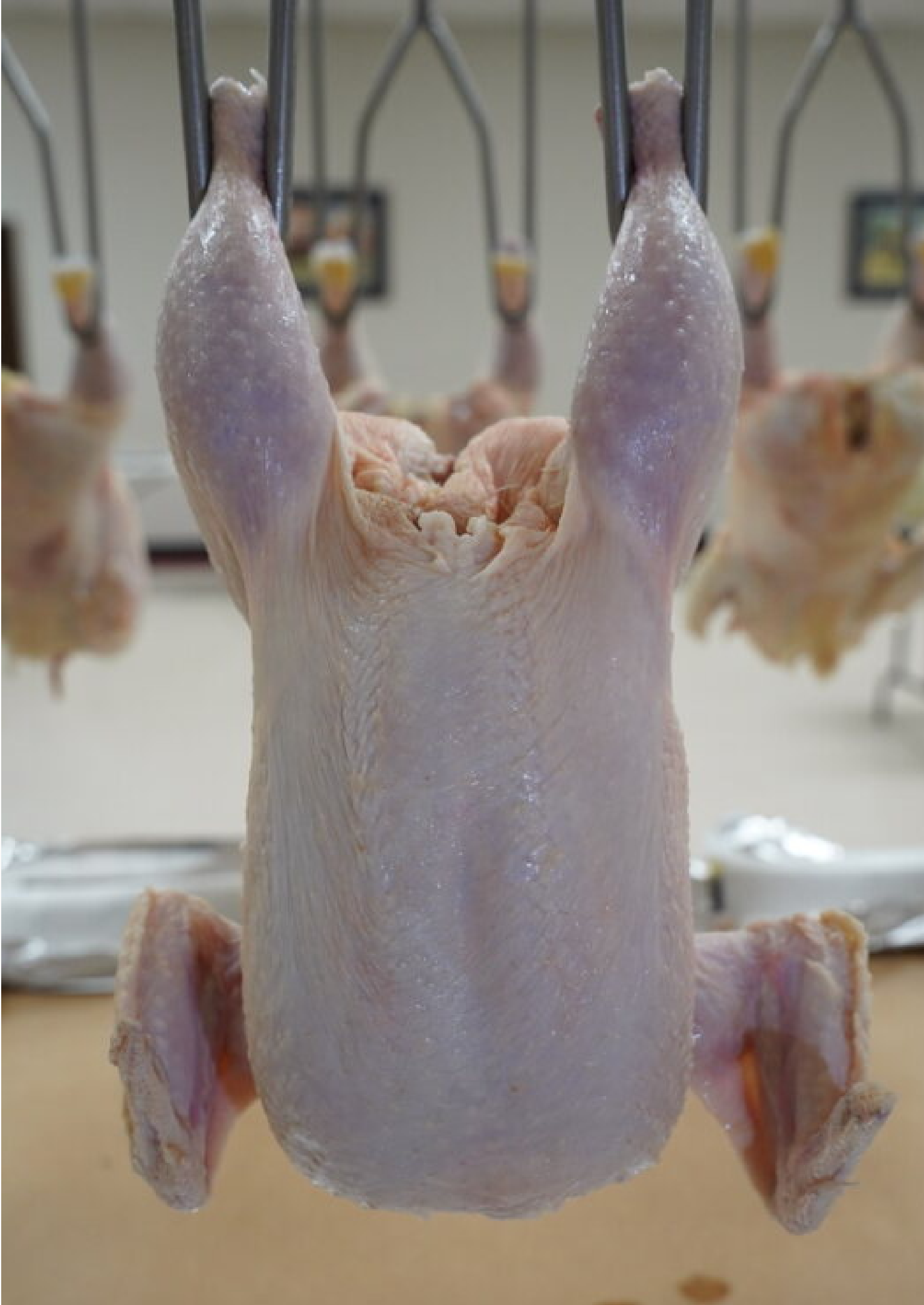
B Tail cut not flush with thighs, cuts on wings