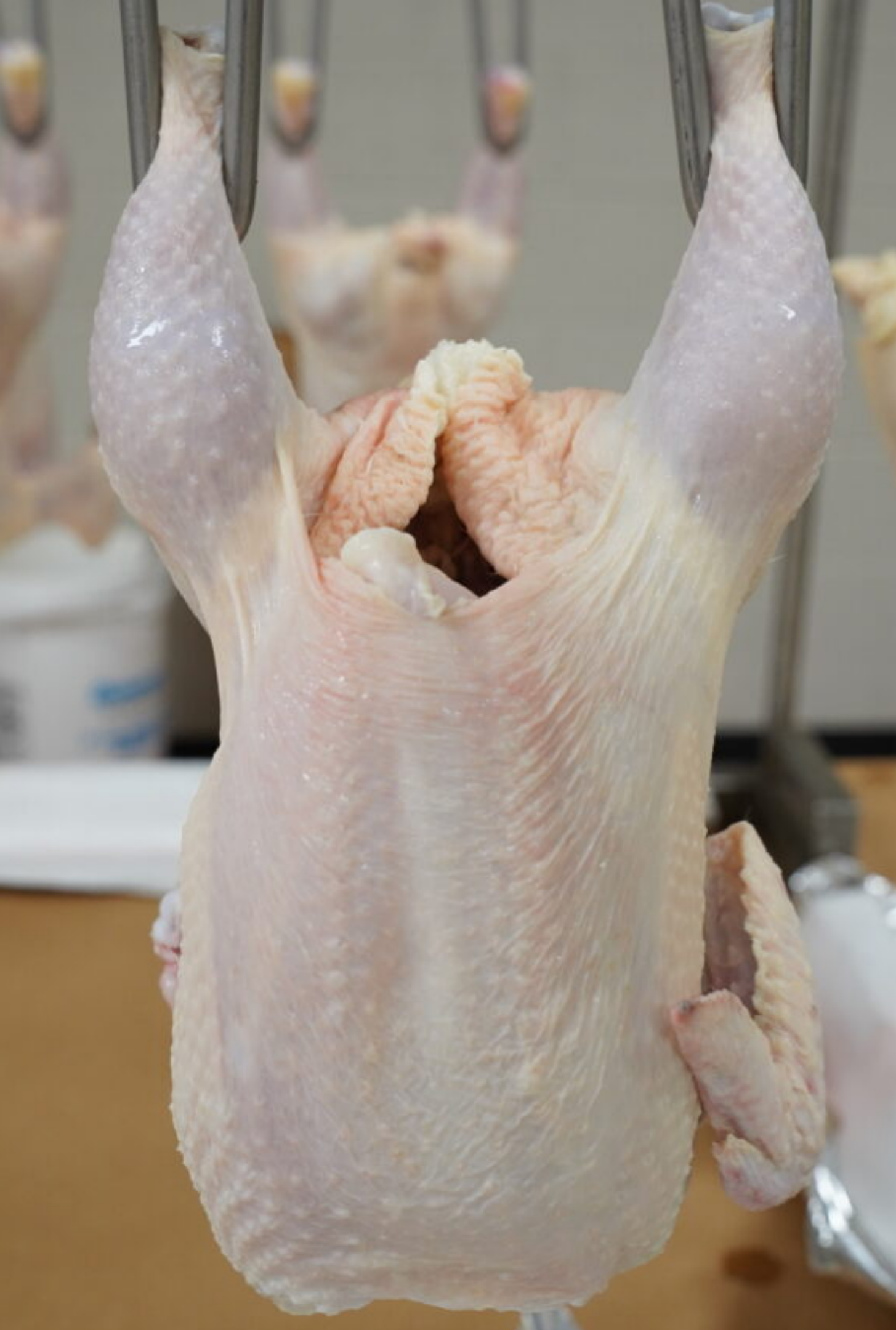
B Missing wing flat