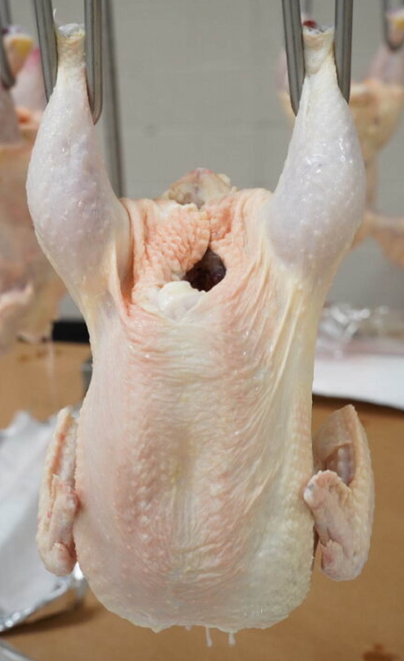
B Exposed flesh greater than 1/4" on thigh