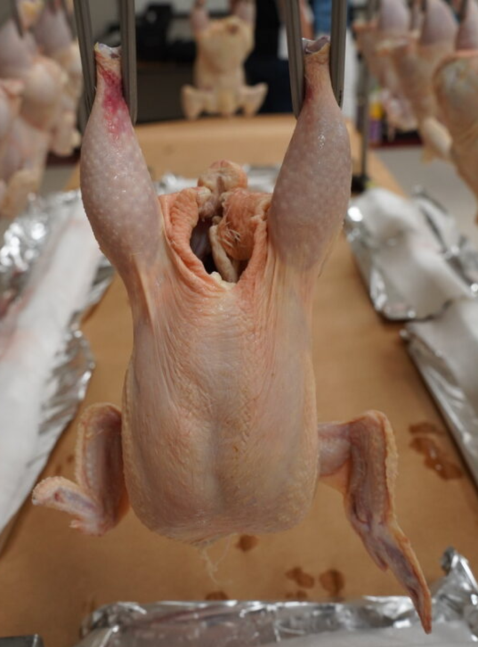
A 1 disjointed wing