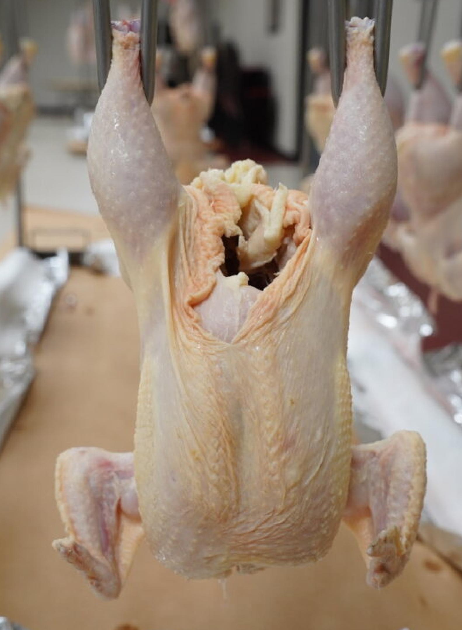
B Exposed flesh greater than 1/4" in the breast