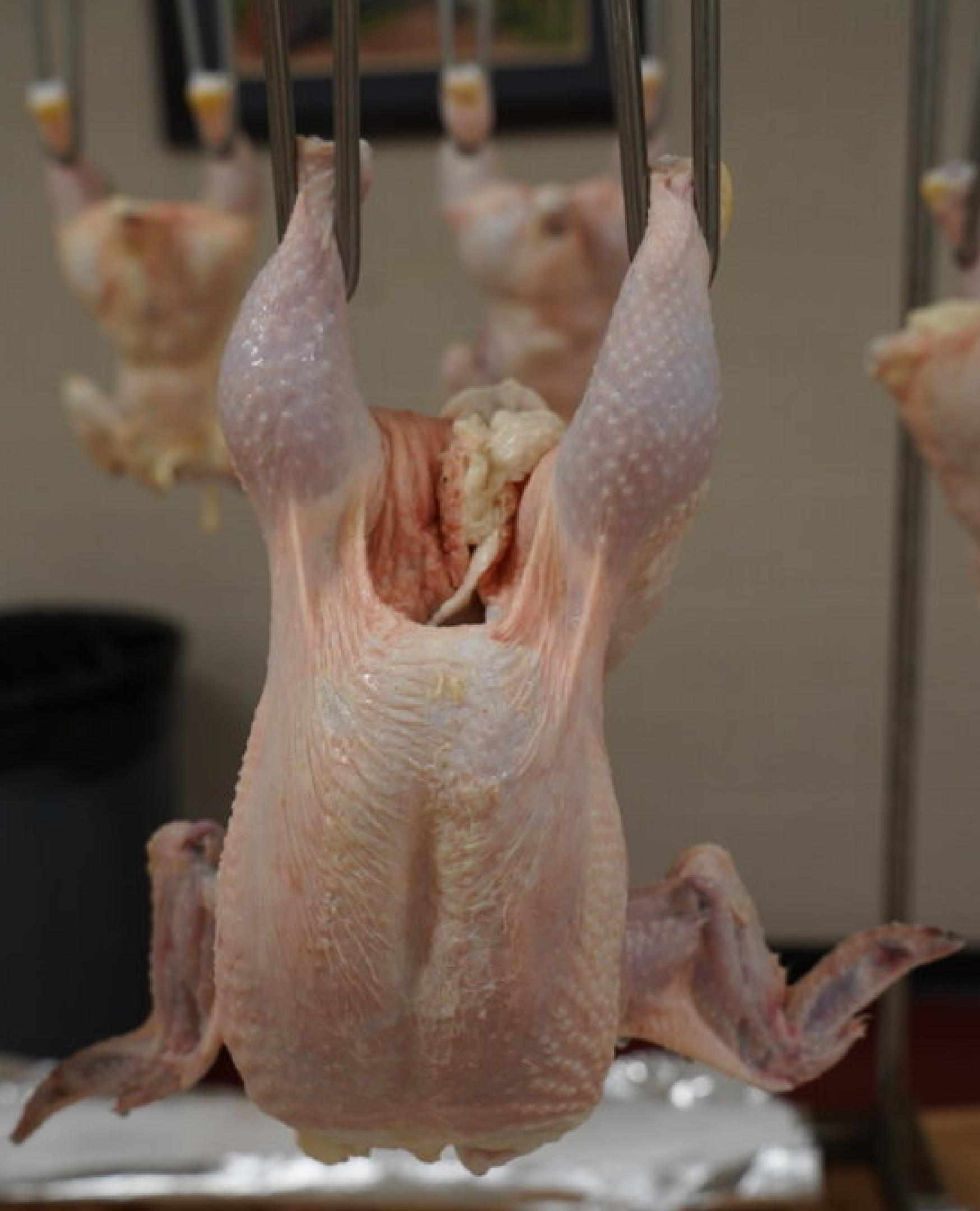
B Dislocated wing