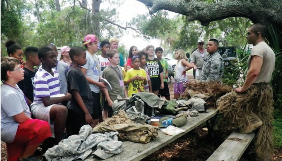
Military and civilian youth alike gain opportunities to appreciate the diversity of roles and jobs military members undertake.

It gives some people that extra little push they need to realize they can succeed despite life's obstacles. It is an amazing experience.